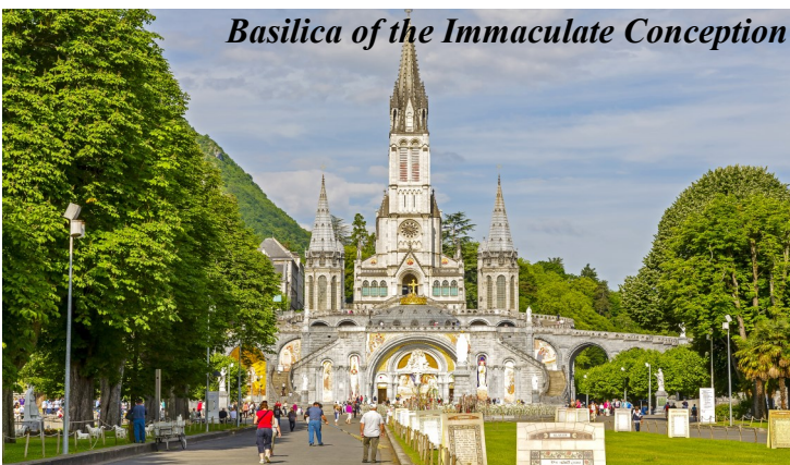
Basilica of the Immaculate Conception