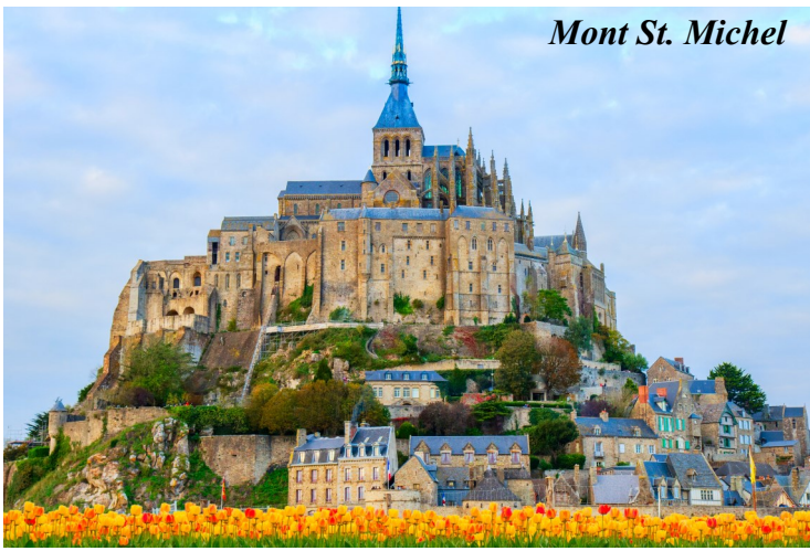
Mont St. Michel