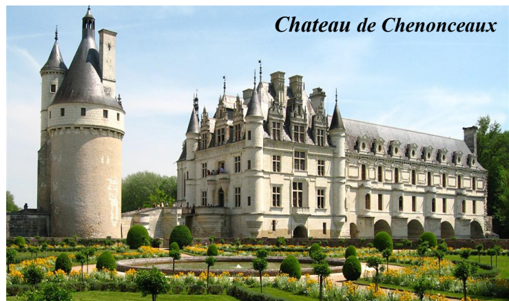
Chateau de Chenonceaux