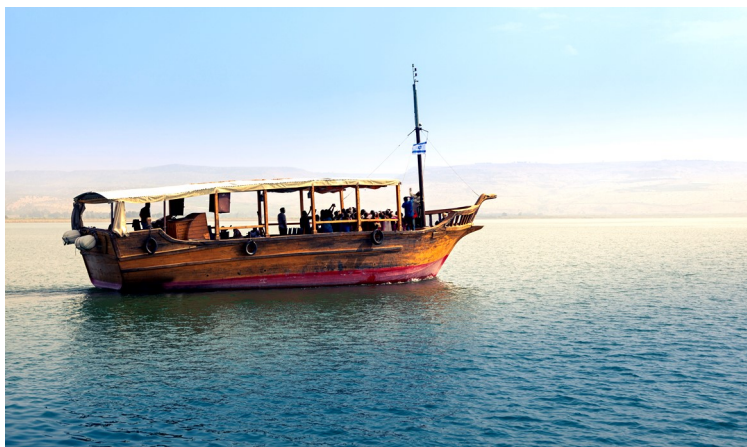
Sea of Galilee